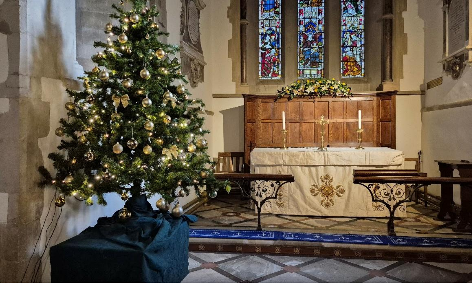
The altar prepared for Christmas