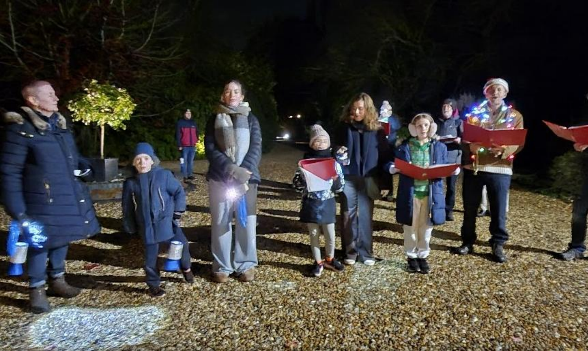
The carol singers for the first evening on Pound Hill