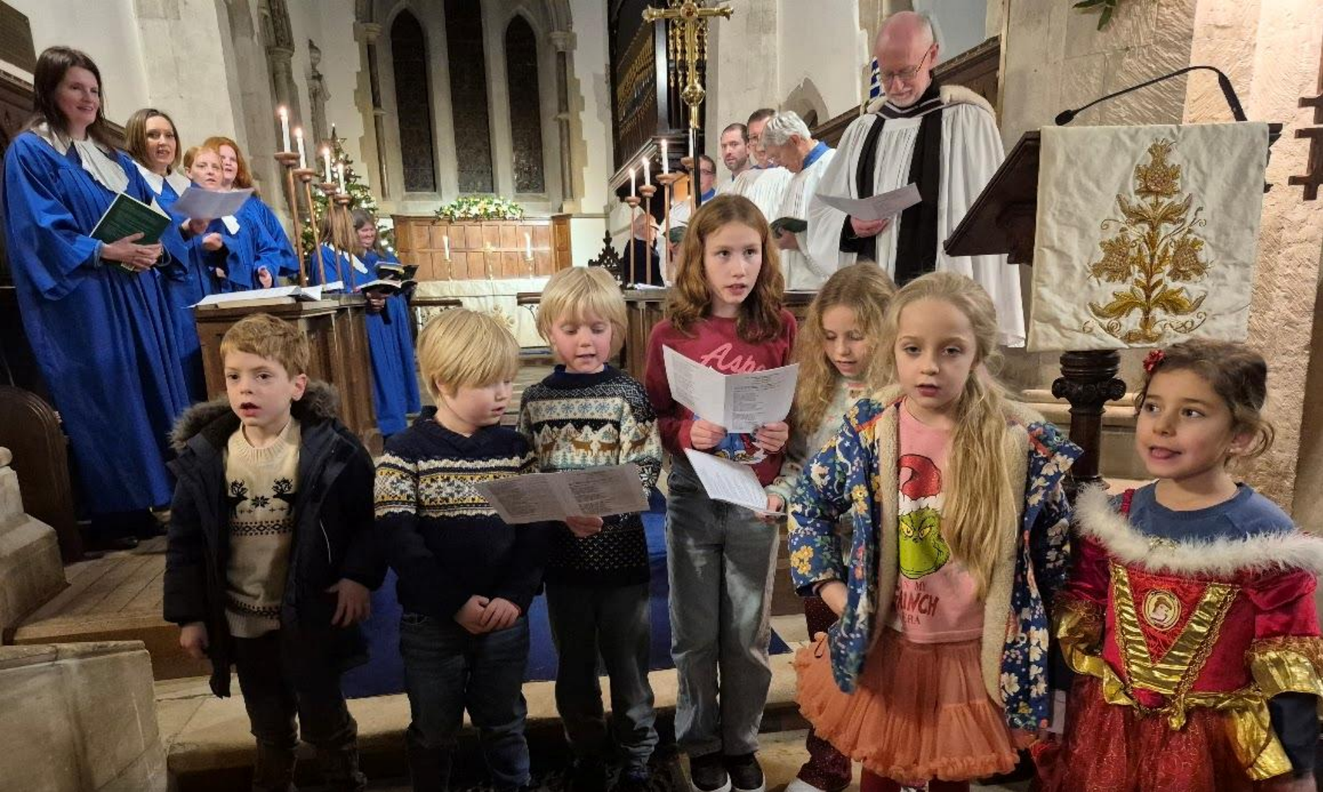
Some of the children come forward to sing the first verse of “Away in a Manger”