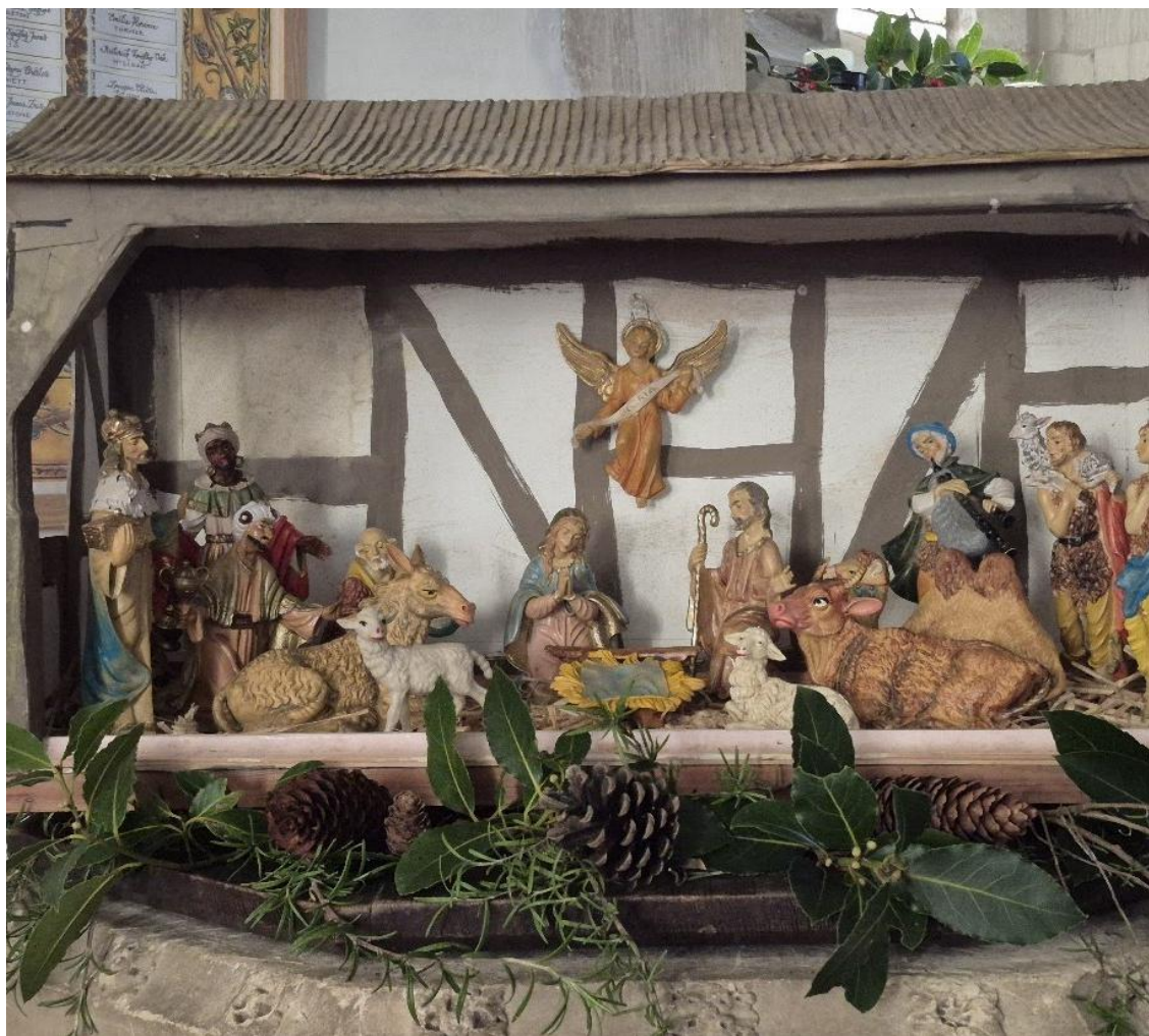
The crib on the font